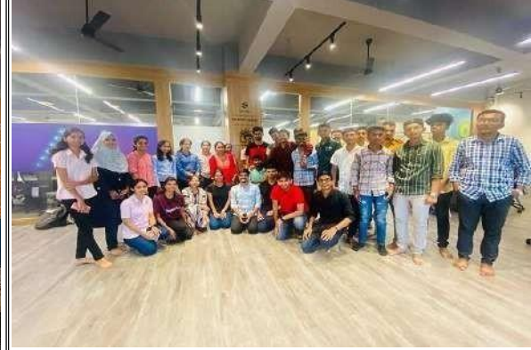
Glimpses during Workshop