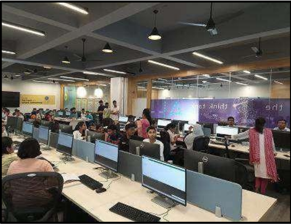
Workshop Feedback : Please find workshop feedback here at link below:

\frac{https://docs.google.com/spreadsheets/d/1BG4Zwlw1CE14-}{Oq9XwxteVng1QQVZQZqZXH4N6nKOzk/edit?usp=shar} \\ \underline{ing}